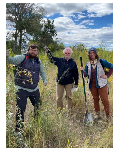
Wyoming Naturalists tag and remove invasive Russian Olives trees along the North Platte River.

Wyoming State Parks, Wyoming Game and Fish Department, and UW Extension, provides education and training to participants in biodiversity, ecology, conservation, management, and interpretation so that naturalists can become leaders protecting our natural resources in the special place where we live. Collectively, the naturalists have volunteered over 2,000 hours to conservation education and service projects. Learn more about the Wyoming Naturalist Program at https://bit.ly/ WyoNP